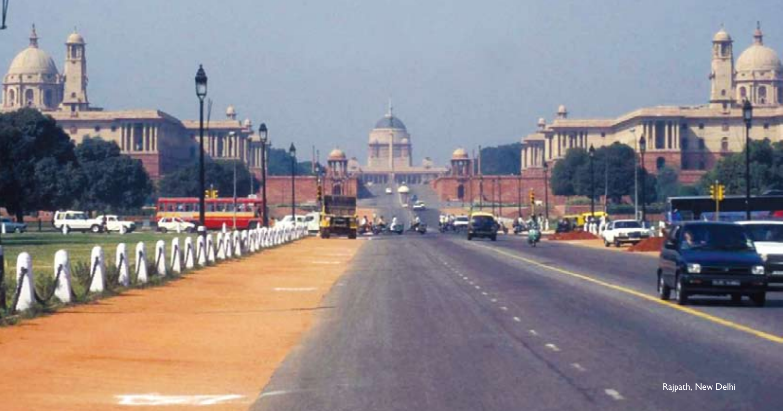
Rajpath, New Delhi