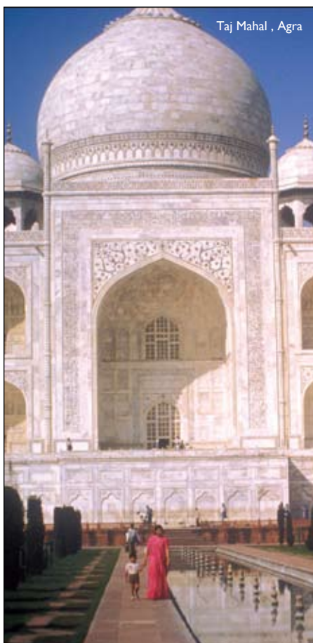
Taj Mahal , Agra