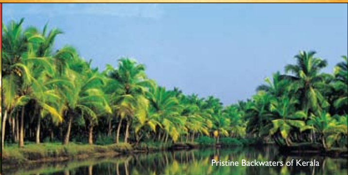
Pristine Backwaters of Kerala