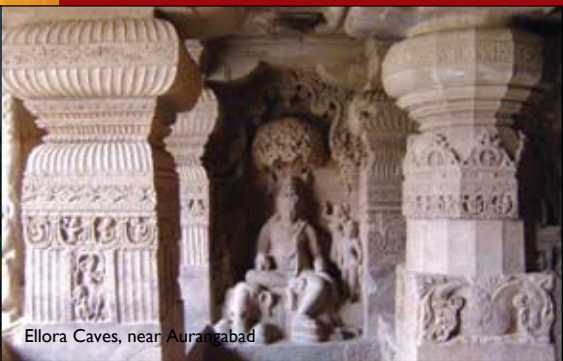
Ellora Caves, near Aurangabad