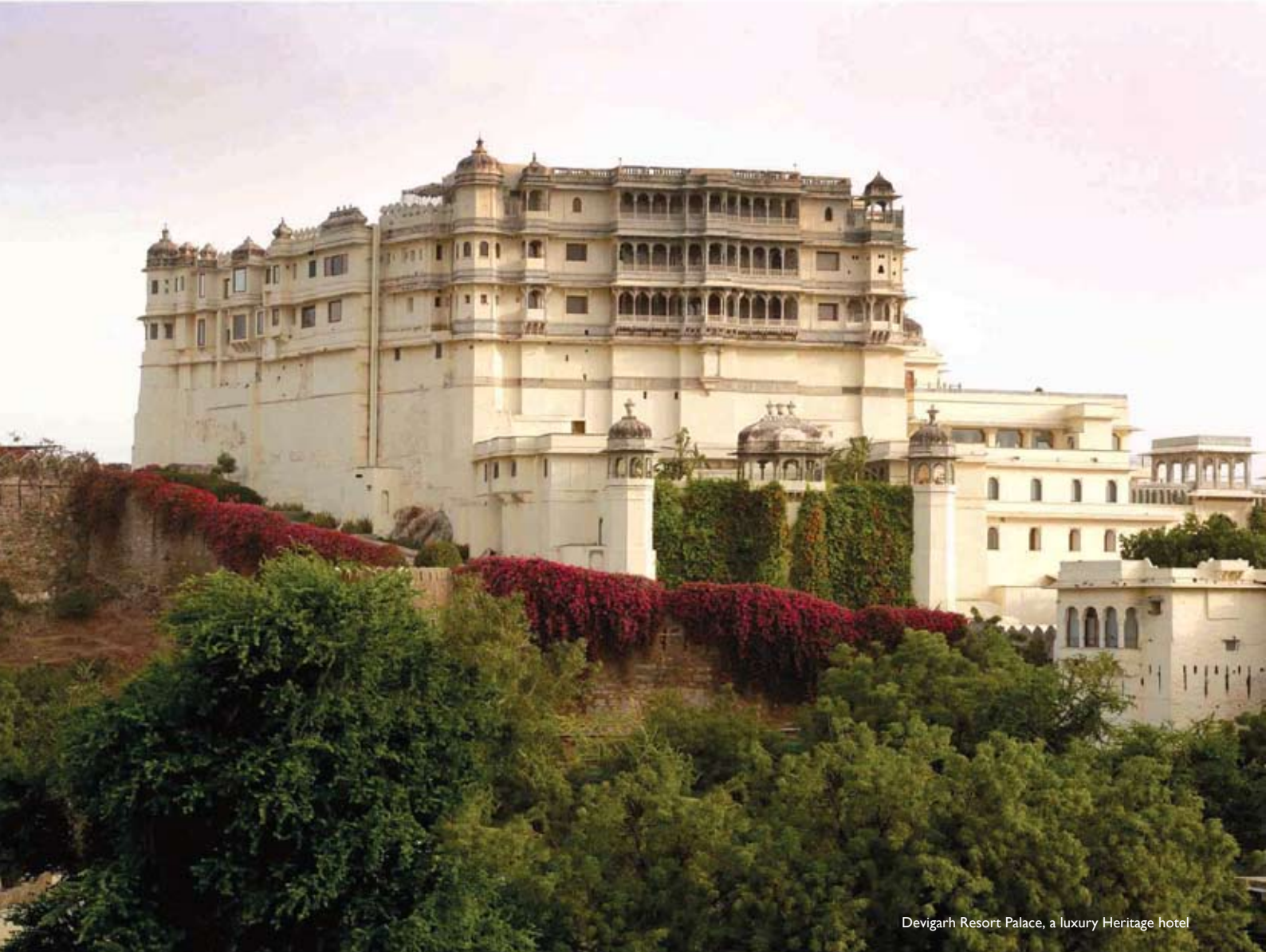
Devigarh Resort Palace, a luxury Heritage hotel