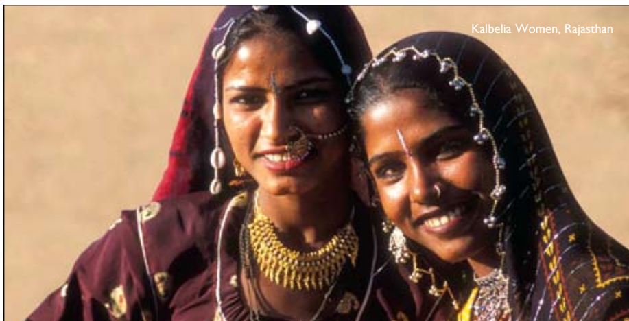
Kalbela Women, Rajasthan