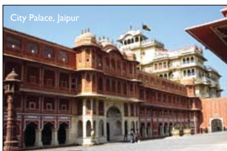
City Palace, Jaipur