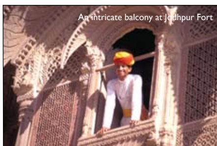
An intricate balcony at Jodhpur Fort