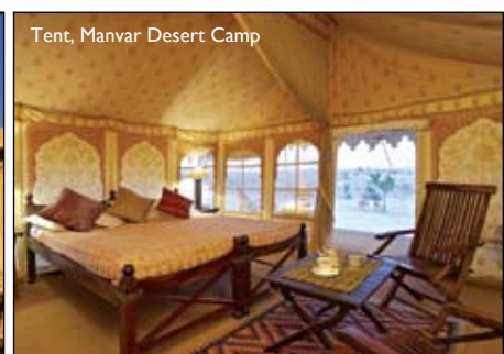
Tent, Manvar Desert Camp