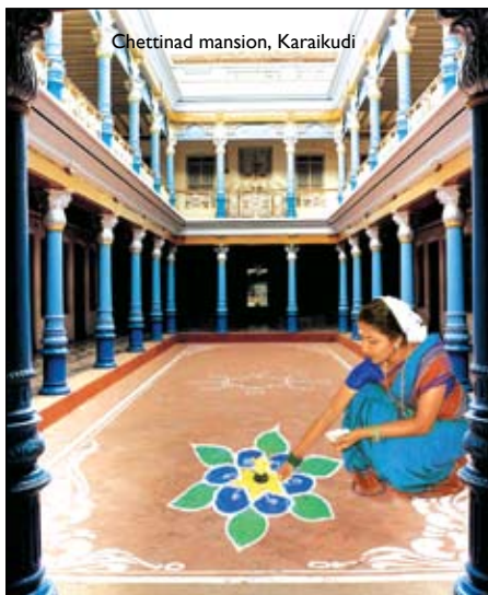
Chettinad mansion, Karaikudi