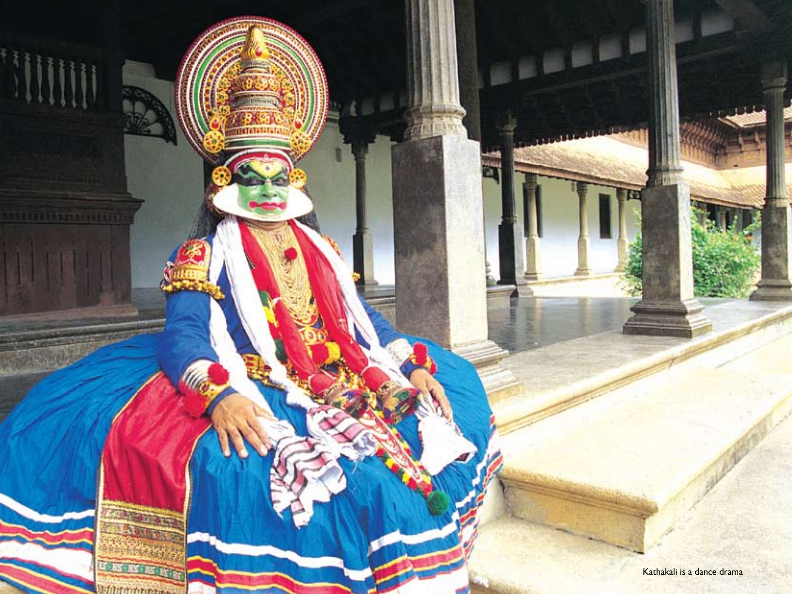
Kathakali is a dance drama